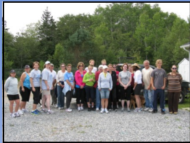
2011 Terry Fox Run Participants

All three levels of government contributed to this investment. The Municipality of Shelburne contributed $52,000; our funding partners contributed as follows: ACOA - $85,200; the NS Dept of Economic & Rural Development & Tourism - $34,515; the NS Dept of Health & Wellness - $30,000; the NS Dept of Seniors - $5,000; and the Resource Recovery Fund Board - Region 6 Waste Diversion - $2,975 for a grand total of $209,690.