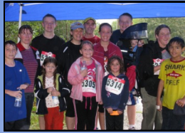
2011 Sable River Family Fun Run Participants