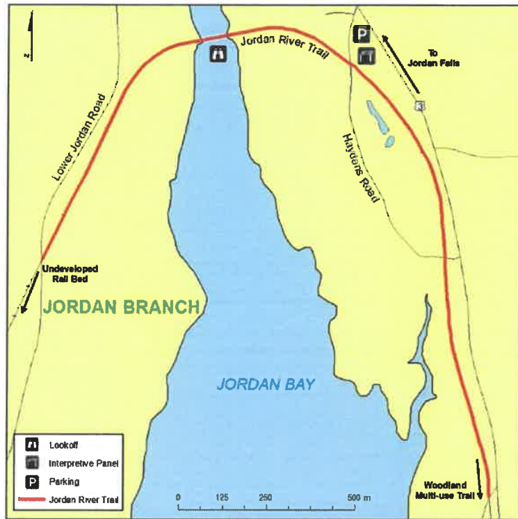
Map of Jordan River Trail